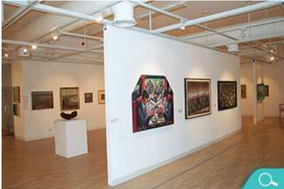
System 400 – not feasible - works off a fixed ceiling grid